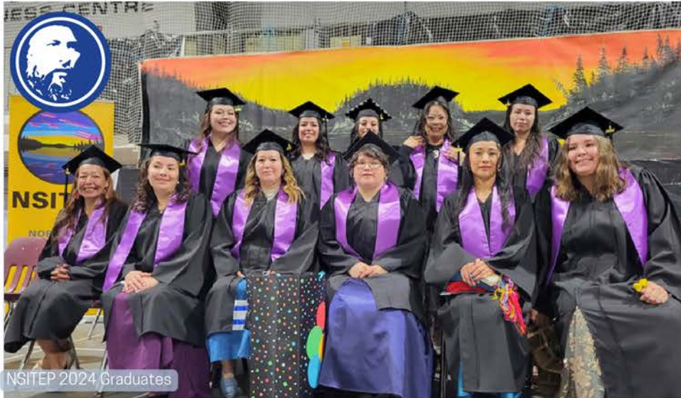
NSITEP 2024 Graduates