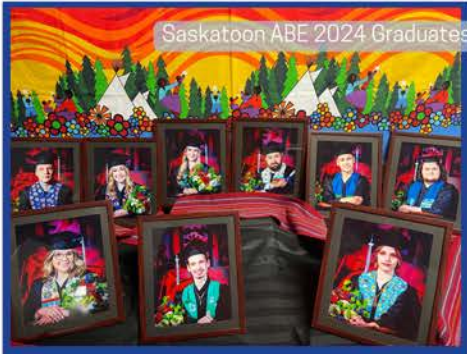
Saskatoon ABE 2024 Graduates