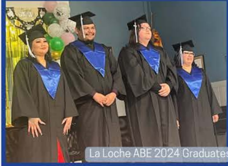
La Loche ABE 2024 Graduates