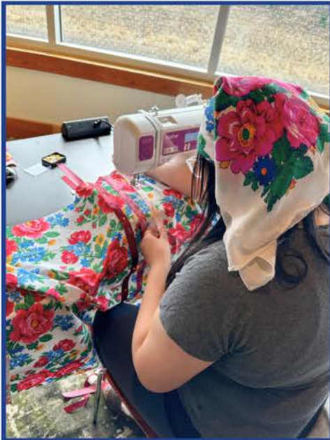
2024 MMIWG2S Ribbon Skirt/Shirt Healing Workshop.